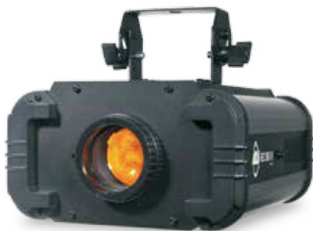
H2O DMX IR