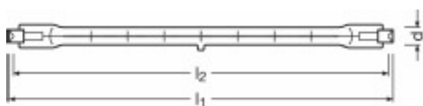
Product line drawing