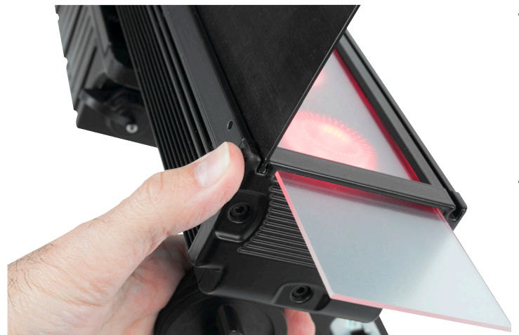
Glare Shield and (2) Lens Filters Included