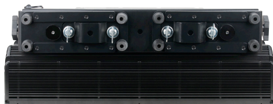
Optional Omega Brackets For Clamps (not included)