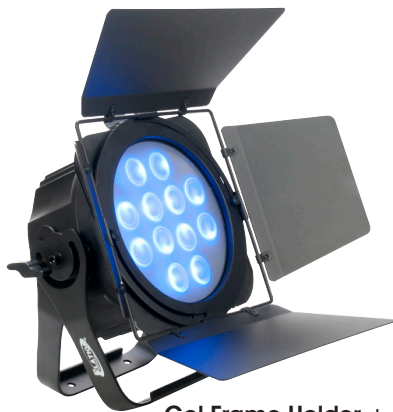
Gel Frame Holder + Barn Door