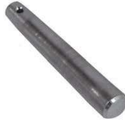
DT 30/40-STEEL PIN CODE: 1749000006