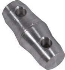
DT 30/40-CC CODE: 1723400008