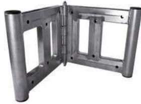
DT CORNER BOOK CODE: 1723400019