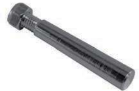
DT 30/40-STEEL PIN-M8 CODE: 1749000007

for DT 31 -> 44 incl. M8 self locking nut