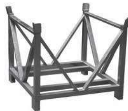
DT DOLLY-BPS 8080 CODE: 1720000014

to store 10x BPS 8080 L 958mm W 958mm H 819mm KG 63,0