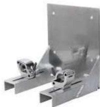
DT 30-WALL MOUNT CODE: 1723400029

for DT 33 & DT34 incl. clamps Max. load capacity: 500 Kg L 250mm W 310mm H 400mm KG 8,5