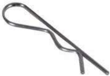
DT 30/40-SAFETY CLIP CODE: 1744000010

for DT 31 -> 44 incl. M8 self locking nut