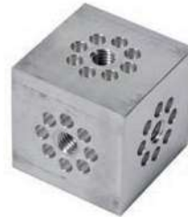
DT CUBE 1 CODE: 1720000008

for DT 31 -> DT 44 M10 L 50mm W 50mm H 50mm KG 0,1