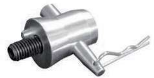
DT HC-CUBE 1 CODE: 1710000012

for DT 31 -> DT 44 M10 L 50mm W 50mm H 50mm KG 0,1