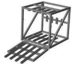
DT DOLLY-BPS 650 CODE: 1720000015

to store 4x BPS 650 L 725mm W 500mm H 725mm KG 39,0