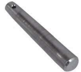
DT 30/40-STEEL PIN CODE: 1749000006