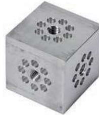
DT CUBE 1 CODE: 1720000008

for DT 31 -> DT 44 M10 L 50mm W 50mm H 50mm KG 0,1