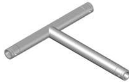
DT 31/2-T35 CODE: 1721200006

3 way T-joint L 500mm W 500mm H 50mm α 90° KG 1,1