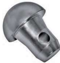
DT 30/40-TERMINAL PIECE CODE: 1749000008

for DT 23 & DT 31 Material: steel | incl. half connectors L 400mm W 400mm H 10mm KG 12,2