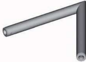
DT 31/2-L60 CODE: 1721200002

2 way corner 60° L 500mm W 500mm H 50mm α 60° KG 1,1