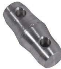
DT 30/40-CC CODE: 1723400008