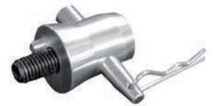
DT HC-CUBE 1 CODE: 1710000012

for DT 31 -> DT 44 M10 L 50mm W 50mm H 50mm KG 0,1