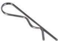
DT 20/40-SAFETY CLIP CODE: 1744000010