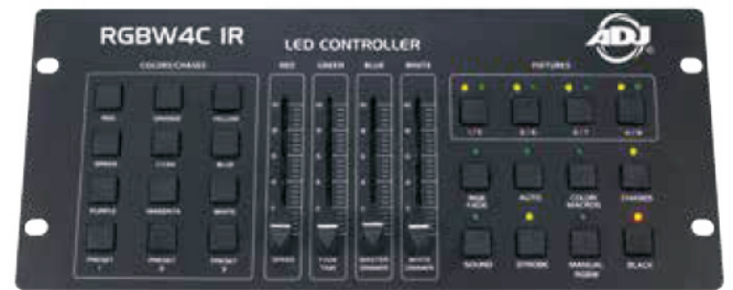
RGBW 4C IR