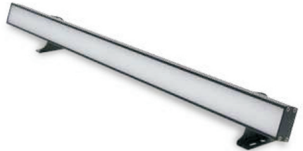
FLASH KLING STRIP