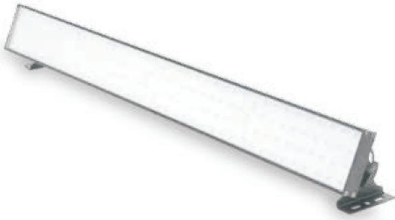
FLASH KLING BATTEN